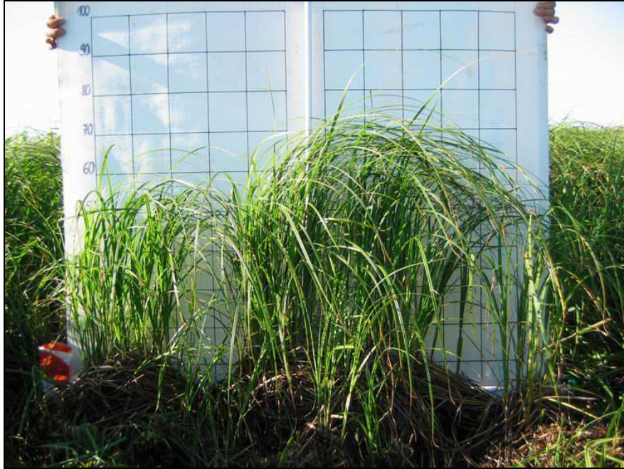
Fig. 4: Past Aquatic warbler breeding site in the Polish National Park "Warta Mouth". The Carex gracilis litter layer is 30-40 cm thick. The picture was taken in June 2004.

On the basis of our preliminary results from West-Pomeranian breeding sites and of literature data, the following management recommendations for Aquatic Warbler conservation in Western Pomerania are identified: