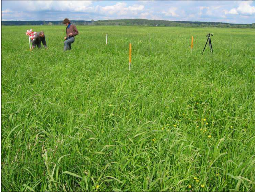
Fig. 3: Aquatic Warbler breeding site in the German National Park “Lower Odra valley”. The picture was taken in June 2004 during fieldwork.

In the Lower Odra valley, Aquatic Warbler breeding habitats have a mixed vegetation of sedges and grasses with as dominant species Calamagrostis canescens , Carex gracilis , C. riparia , and Phalaris arundinacea (sites nearby the Polish Landscape Park “Lower Odra valley”) or Carex gracilis , Phalaris arundinacea , and Glyceria maxima (most sites in the German National Park “Lower Odra valley”) (Fig. 3). Some sites in the German National Park “Lower Odra valley” and in the Polish National Park “Warta mouth” almost exclusively consist of Carex gracilis reeds. All currently used sites were mown in previous years. Many formerly inhabited but currently abandoned sites are no longer being mown (e.g. German National Park “Lower Odra valley”, Polish Landscape Park “Lower Odra valley”, and Polish National Park “Warta mouth”).