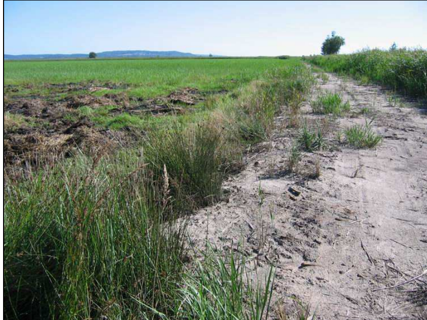
Fig. 2: Aquatic Warbler breeding site on Kasiborska Kępa, Poland. The area to the left is a Phragmites communis reed used for summer-cutting, the one to the right is used for winter-cutting. The picture was taken in September 2004.

The coastal habitats predominantly consist of scantily growing Phragmites australis reeds under different types of use: summer and winter cutting reed with sparse sedges (e.g. A. acutiformis ) at Kasiborska Kępa (Fig. 2), cattle grazed reed in the Świna delta, summer cutting reed hindered by late frosts with a dense Thelypteris palustris ground layer at Rozwarowo, cattle grazed brackish grasslands with scattered, low reeds on the Freesendorfer Wiesen (Sellin 1989).